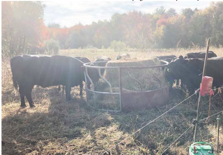
early) we should have enough hay to make it through the winter. We culled two older cows and brought the big bull and a big steer to the butcher in October. By February, the herd stood at 8 cows, and 11 calves (5 old, 6 young) all seemingly contented, eating hay again in the barn yard at Snyder Farm on Southeast St.

We raised 6 calves & 1 bull (born in 2019) in Hubbs' pasture (between our Lower & West Fields) beginning in May. This big group out-grew the pasture, which was somewhat stressed by the drought, so we moved them in August to the North Field at Small One's Farm where they were very happy through the fall on 5 acres of grass & clover. We also had 6 calves who were born in 2020 (4 in May/June & 2 in Nov/Dec) who stayed with the herd at Snyder Farm. With the uneven moisture, our grazing was somewhat challenging to keep steady this year. Luckily our neighbor Jason Edwards cut some extra bales for us (from the Gray Farm and the Tate Farm on Middle St.) so even though we needed to start feeding in late October (one month