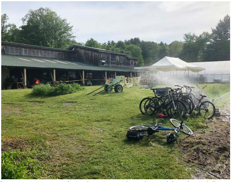
The Pandemic Farmyard - weeder crew bike rack & Zobel's tent

"Thank you for providing such a vital resource. Having safe access to fresh, locally grown vegetables and fruit has always been important, but at the moment, it feels downright critical. At the risk of sounding dramatic, Brookfield Farm feels a bit like a lifeline right about now"