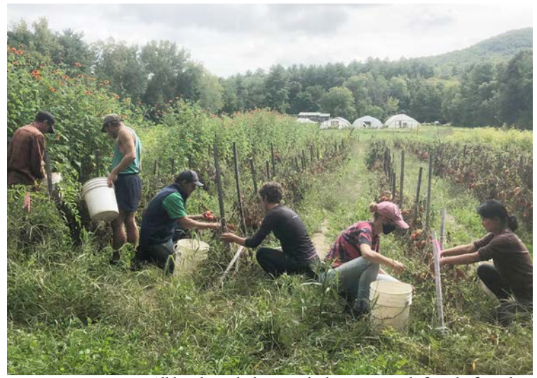
All hands on deck to get the last tomatoes before the frost does