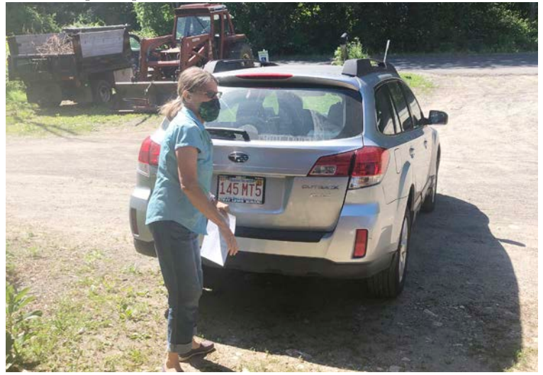
"Our Farm Year," cont.

it's good for us to know how the share stacks up from year to year, so that we can compare that to the general marketplace. It also helps us to quantify how shareholders really do help by taking on a piece of the risks and rewards of our farm production, a core piece of the CSA model. The numbers confirm what we have, at this point seen many times in the past: on tough growing years by spreading the risks among many families, we are able to keep the farm in good financial shape with only a modest rise in costs to each shareholder.