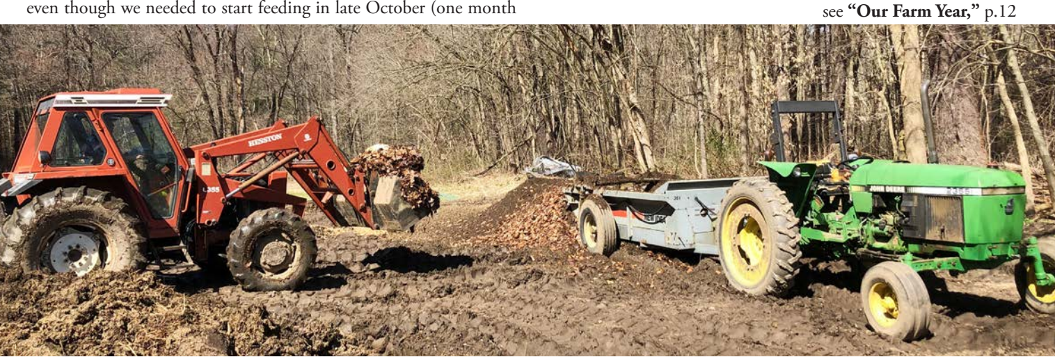
Jake at the beginning of 150 tons of compost making in May

Before we brought the herd back into the barnyard, we cleaned out last year's manure/hay deposit. We shoveled out the barn, and then used the loader to scrape the barnyard and make a great compost pile – about 60 tons. This will be ready to spread in the spring. In April and May, we spread about 200 tons of compost onto about 1/3 of our vegetable fields (about 20 tons/acre). And in May we made compost from the materials that had been delivered in late 2019 when the ground dried (one great thing about the spring drought!). Later in the fall, at our compost site on Hulst Rd, we gathered materials (leaves from the town of Amherst, food waste from Not Bread Alone, veggie scraps from our harvest shed, cow manure from Cook Farm in Hadley). Snow came in early December causing us to hold off on