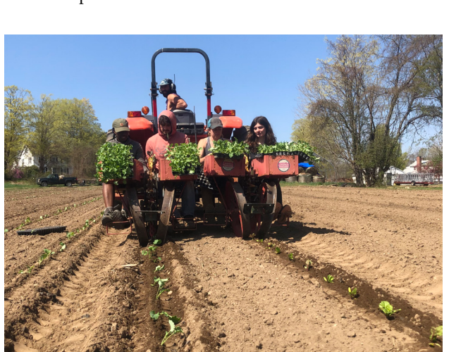
Spring Brassica Going In

How quickly we forget that 2023 was another year of extreme weather, here on the farm and in our greater community. Our spring ended with very late and very hard frosts, which led us scrambling to protect our precious strawberries and blueberries. Wild fires in Canada left the valley blanketed in smoke for much of June, and with us wondering if it was safe to be outside. We then returned to the torrential down pours of our first season here. With the rain came unprecedented early summer flooding of the Connecticut, Mill, Deerfield, South and other rivers in our area. While our fields and crops weren't directly affected by flood waters, it pained us to see so many farms suffer catastrophic losses.