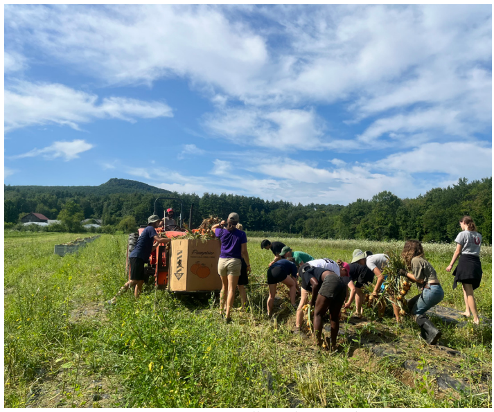
All Hands On Deck For A Onion Harvest