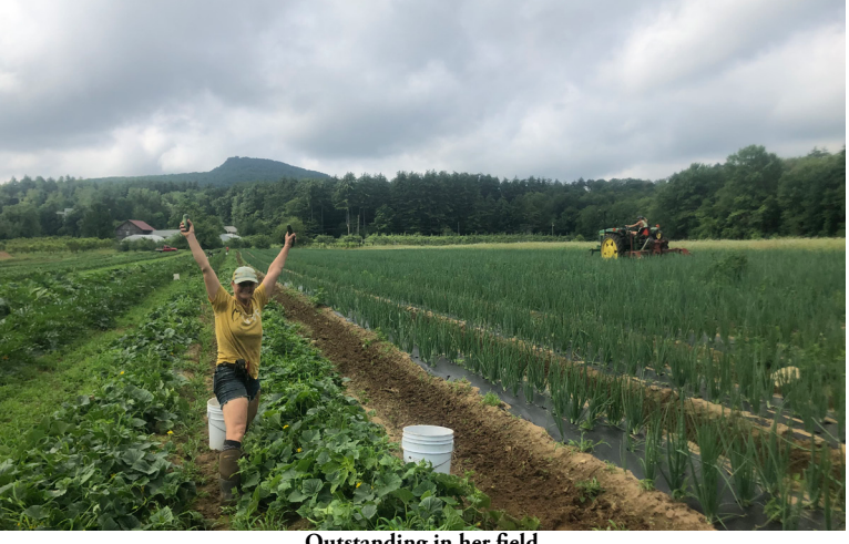
Outstanding in her field

The world is changing all around us and we have no choice but to adapt and change with it. It is nice to know that even if we never have a 'normal' growing season again, we can still figure out ways to keep doing what we do by adjusting our approach and reshaping our thinking.