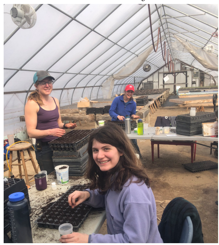
Seeding In The Greenhouse